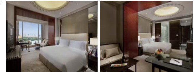
WH Ming Hotel

Note: A special discount price (about 750 - 1050 RMB or 120 - 170 US dollars) at the MH Ming Hotel will be offered to the conference participants. Please check the booking information on the conference website later.