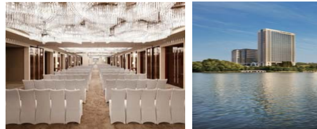
WH Ming Hotel